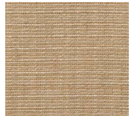
Morning Balsam NML-459