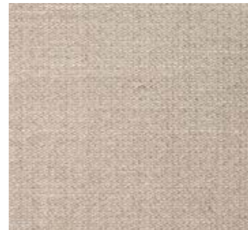
Moon Taupe APX-425