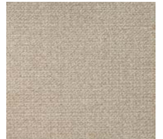
Caen Stone APX-426