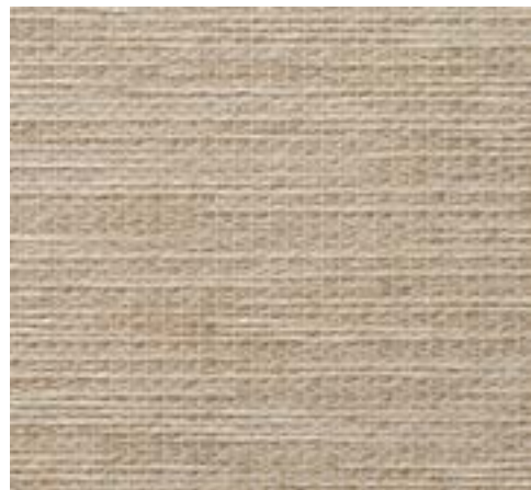
Sir Issac Taupe Prm-484