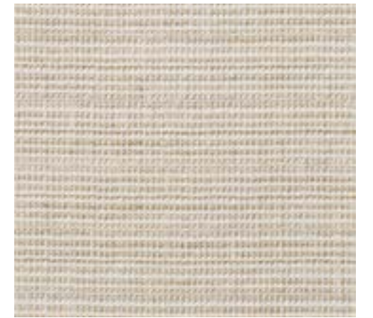
Bare Depth NML-453