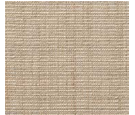
Coso Rock NML-456