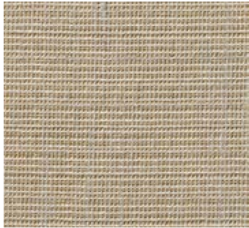
Slubby Sunday NML-460