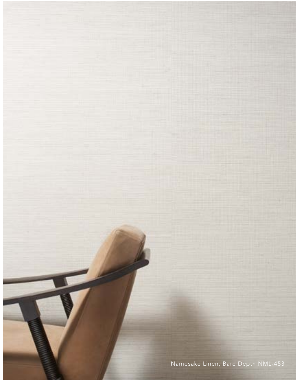
Namesake Linen, Bare Depth NML-453