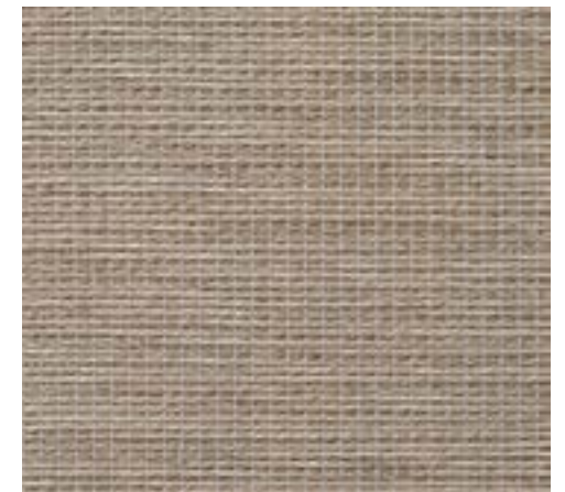
Shimmer Bark PRM-486