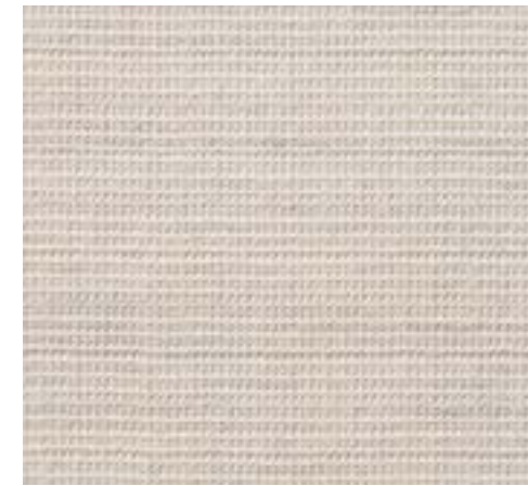
Silver Heir NML-452