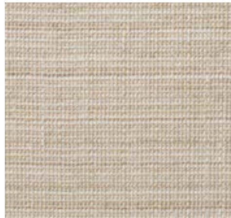
Up Front Neutral NML-454