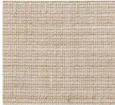
Verte Fresh NML-461