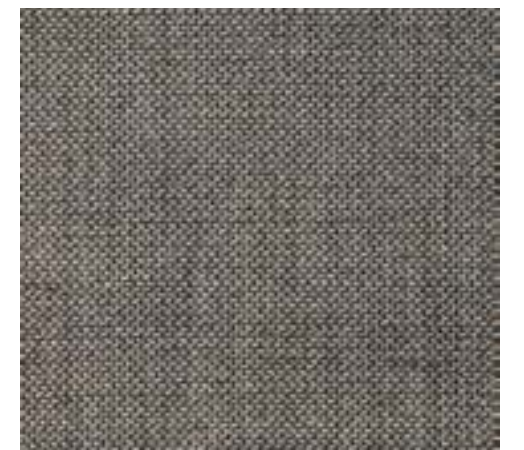
Night Stone APX-429