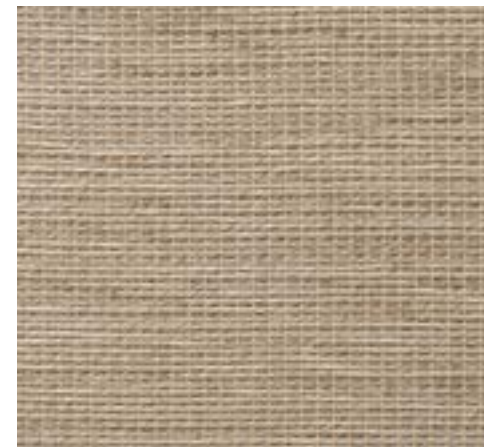
Laurel Beam PRM-485