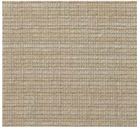
Nature's Nubs NML-462