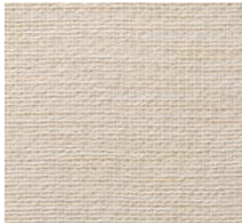
Cosmic Latte PRM-481

Twisty in the best of ways. Linen, Cotton and Rayon literally do the twist together in a unique texture that takes advantage of how the yarns' different densities catch light. 48% Linen, 37% Rayon and 15% Cotton. Packaged in rolls 48" wide & sold in 8 yard increments. Color and texture variations are to be expected with natural fibers. Flammability Rating: ASTM E84 Class A.