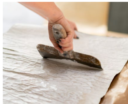
Building layers and textures for Ananta wallcoverings