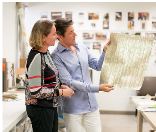
Above: Alchemy wallcovering collection, first launched in 2014 with 6 color ways