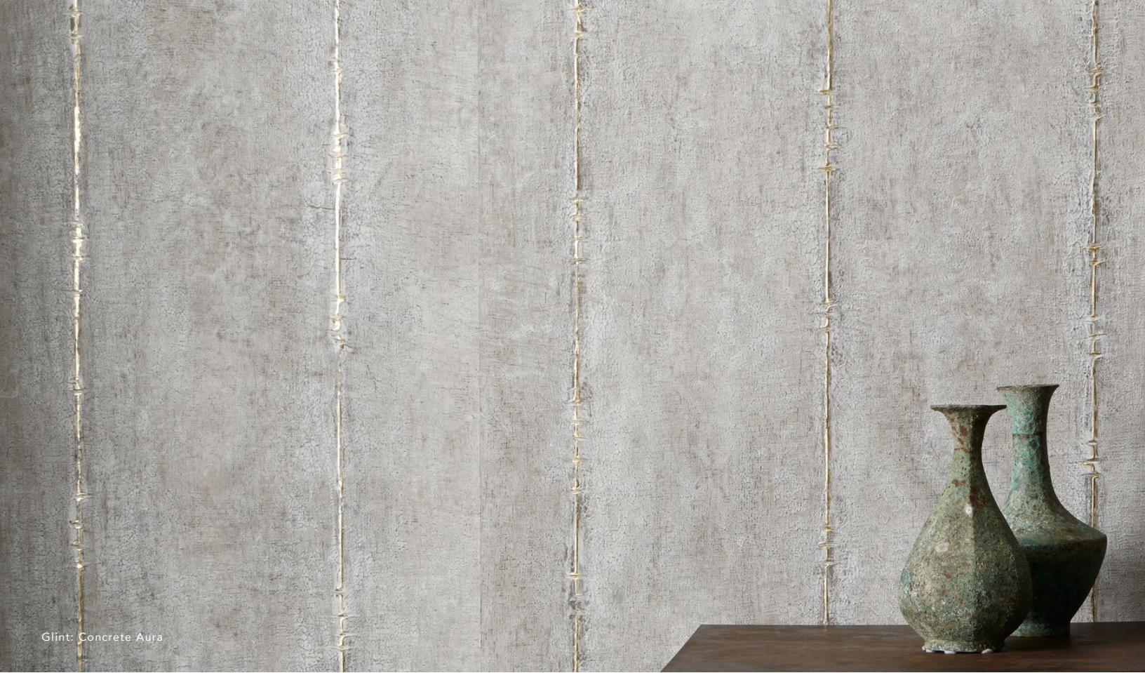
Glint: Concrete Aura