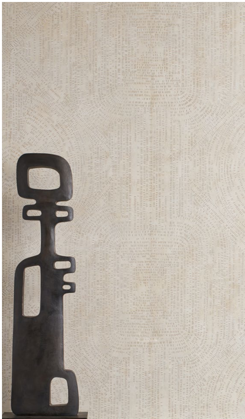
Tribal: Bleached Bone