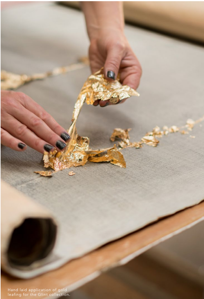
Hand laid application of gold leafing for the Glint collection.