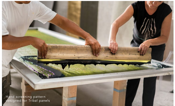
Hand screening pattern designed for Tribal panels